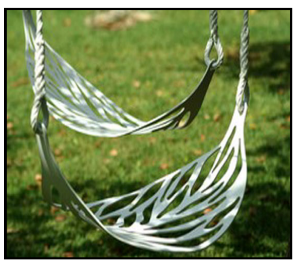
Leaf Swings by Studio Enea.