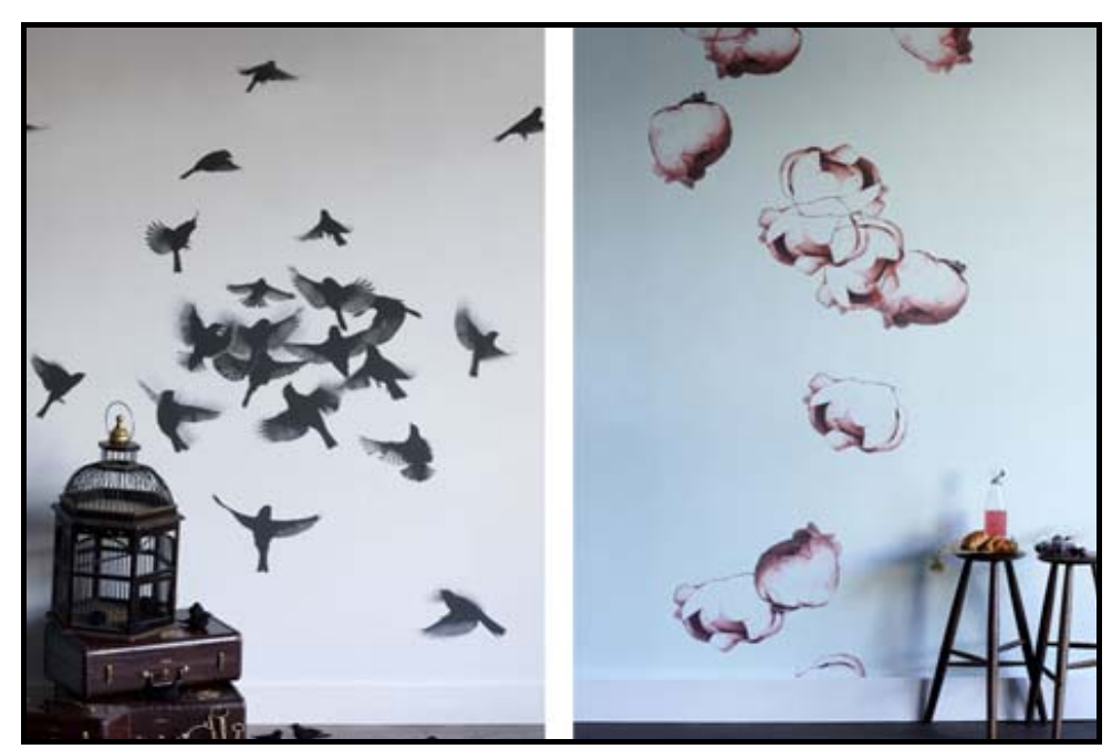
Nature Inspired wallpaper designs by Trove.