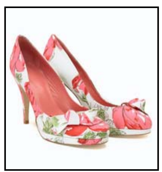
Design in Bloom , shoes by Manolo Blahnik.