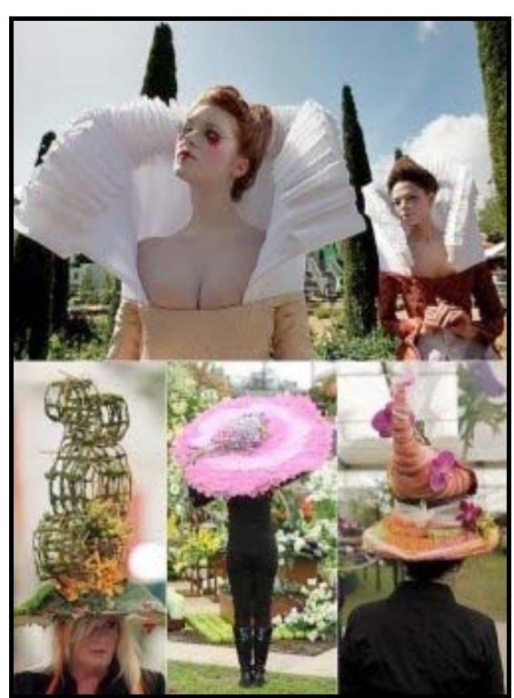
Chelsea Fashion Show, inspired by flowers and foliage.