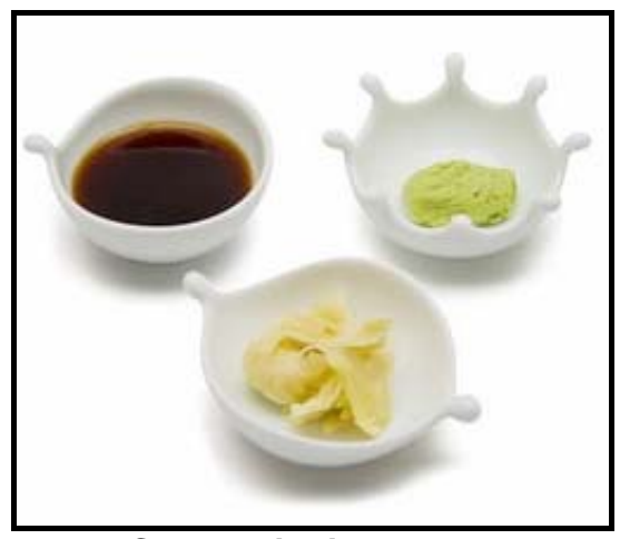
Splash dipping bowls by Akimasa Yamada.