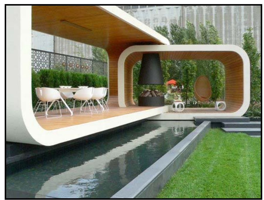
Cacoon by Jack Menlo at the Chelsea Garden Show 2010.