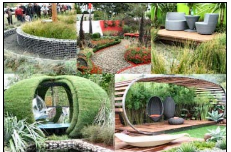
Chelsea Flower Show, award-winning displays in 2010.