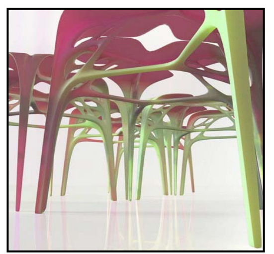
Clover chairs or tables by Widrig.