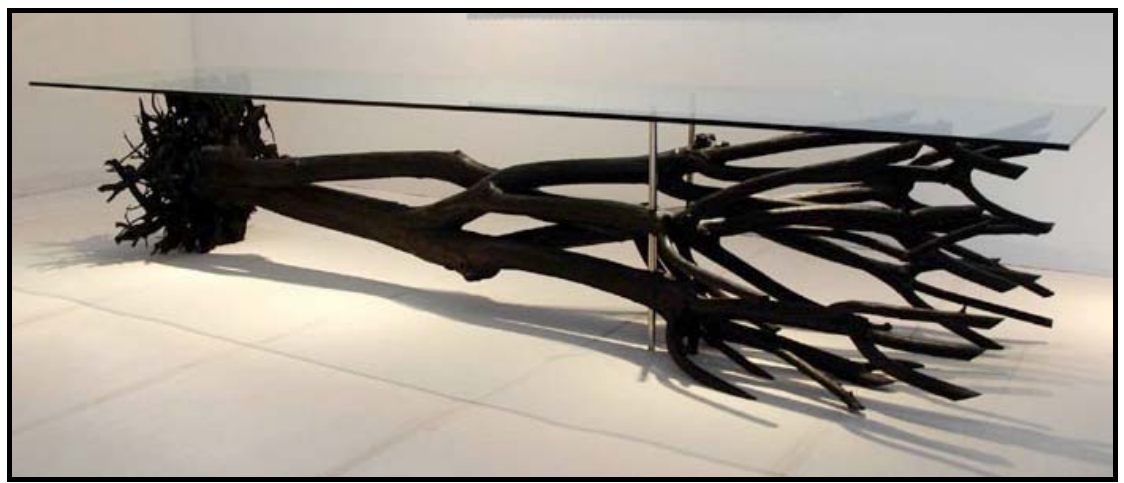
Tree Table by Sebastian Errazuriz.