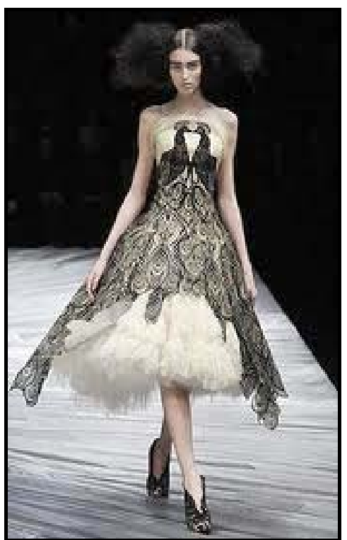
Laser-cut Dress by Alexander McQueen.